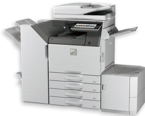
MX-3570N color Advanced Series document system shown with options.