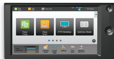
Sharp's customizable touchscreen display offers a user-friendly graphical interface.